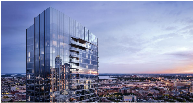
The 35-storey Raffles Boston tower is coming to life following a US$400mn (€358.5mn, £298.5mn) investment / The Architectural Team // Binyan Studios