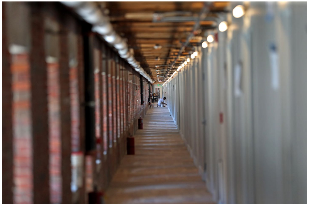
A painter does some finish work along the long hallways that once were used for making rope.