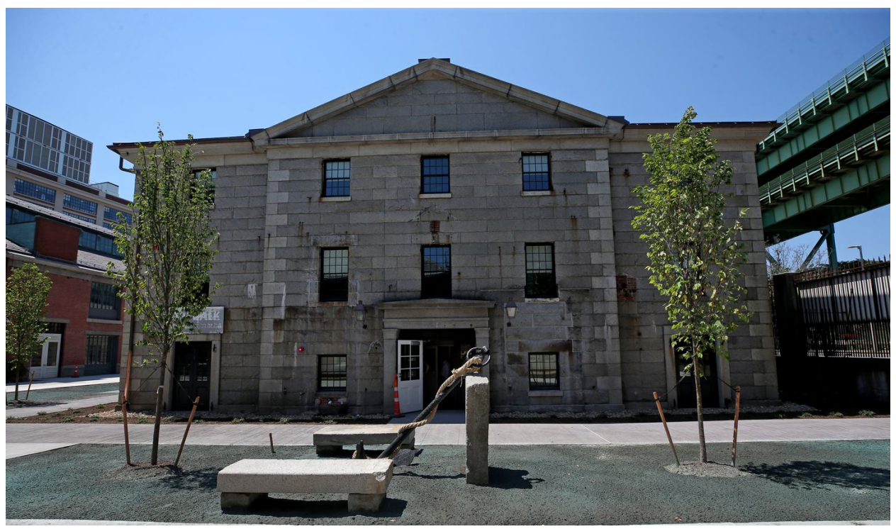
An exterior view of the project.

Finally, though, there is light at the end of this granite tunnel: Vision Properties and the Boston Planning & Development Agency on Wednesday celebrated the completion of 97 apartments in the old rope factory with a ribbon-cutting ceremony.