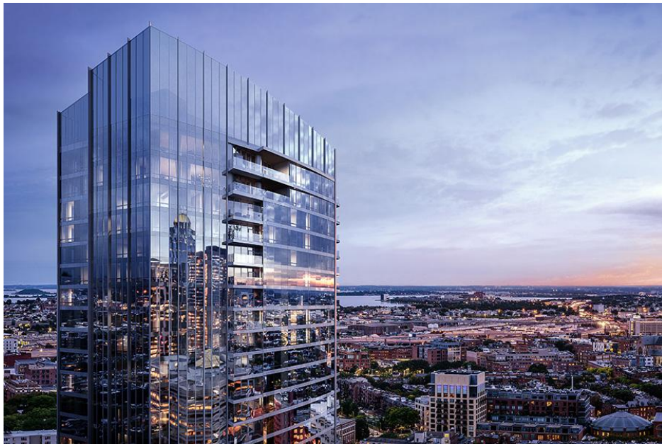
A rendering of the exterior of Raffles Boston by The Architectural Team

There's a new building making its mark on the Boston skyline.