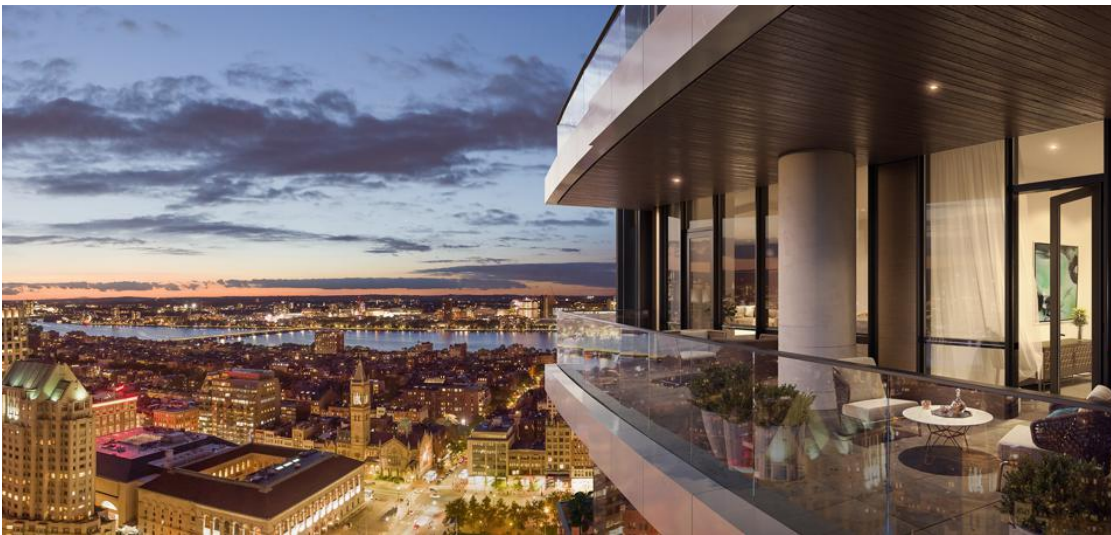
Rendering of Raffles Boston Back Bay Hotel & Residences from a balcony THE ARCHITECTURAL TEAM

The international hotel brand, Raffles, is coming to Boston. The project has not only broken ground, but the structure has gone vertical in Boston's historical Back Bay neighborhood in recent weeks.