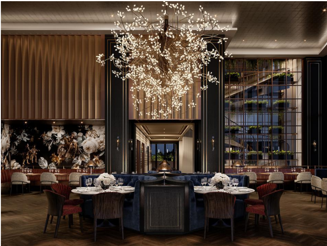
Rendering of Raffles Boston Back Bay Hotel & Residences, Sky Lobby Fine Dining Restaurant