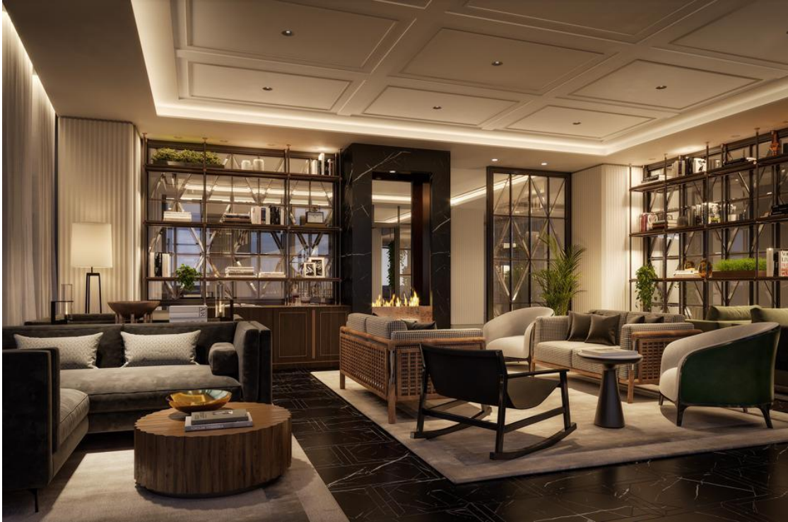
Rendering of Raffles Boston Back Bay Hotel & Residences, Writers' Lounge | STONEHILL TAYLOR

Nantucket Cottage, a Dining Kitchen and Wine Lounge; and the Residents' Private Dining Room.