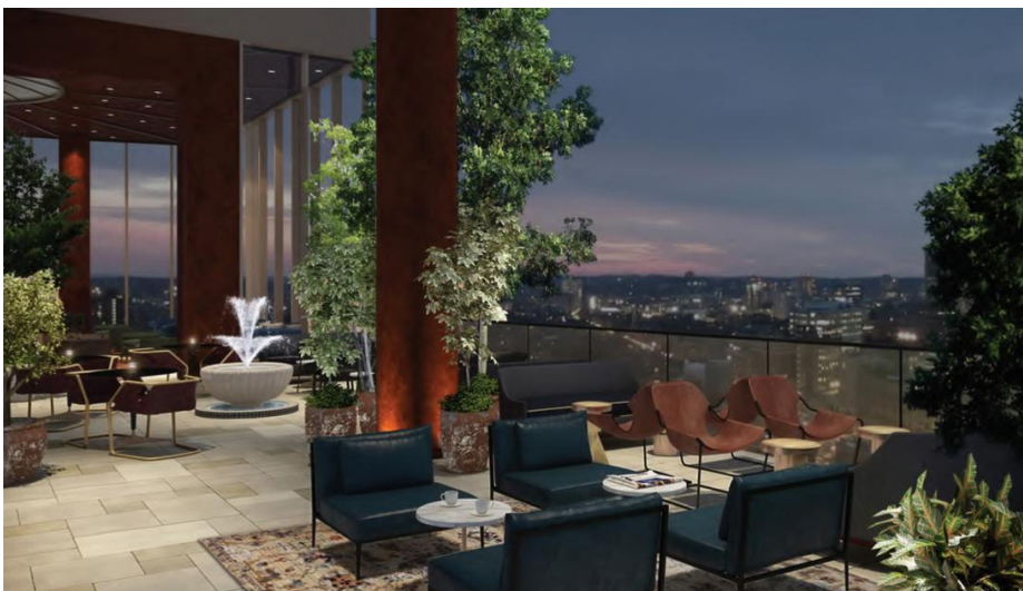
The hotel will also boast another Boston rarity – a 17th-floor entrance lobby