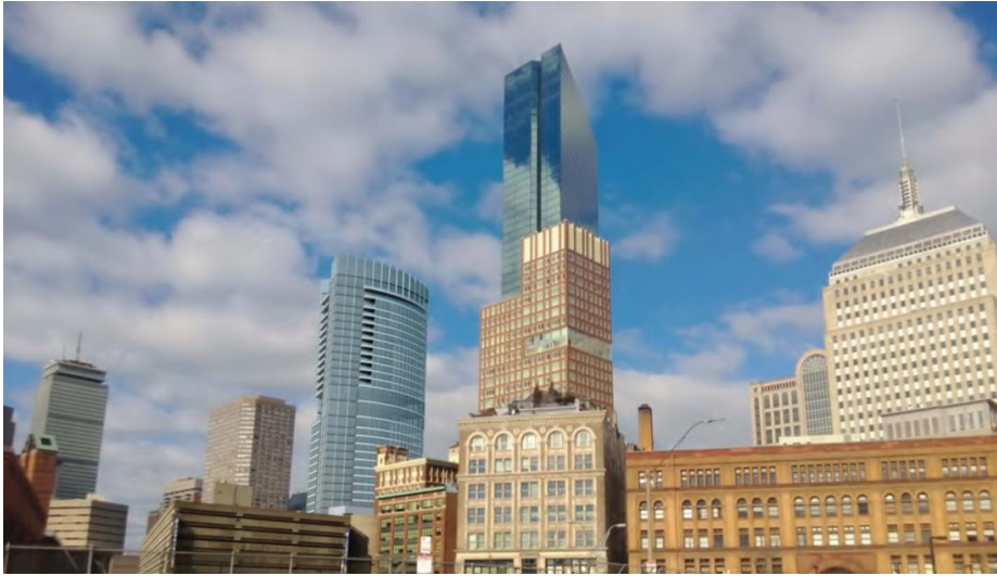
TAT have made efforts so that it can stand apart from other straight-up-and-down towers in the area