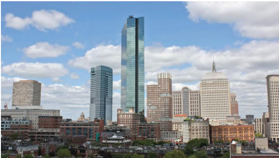
It will sit within earshot of Boston's largest building, the John Hancock Tower