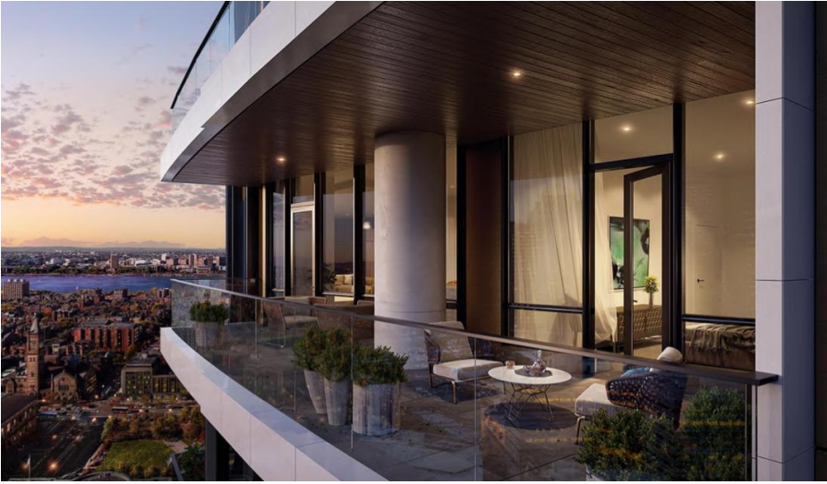
Each hotel room will have its unique vista