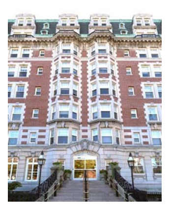
Left to right: exterior, Oliver Lofts, Roxbury, MA; Apartments at Boott Mills, Lowell, MA; preserved façade of Kenmore Abbey, Boston.