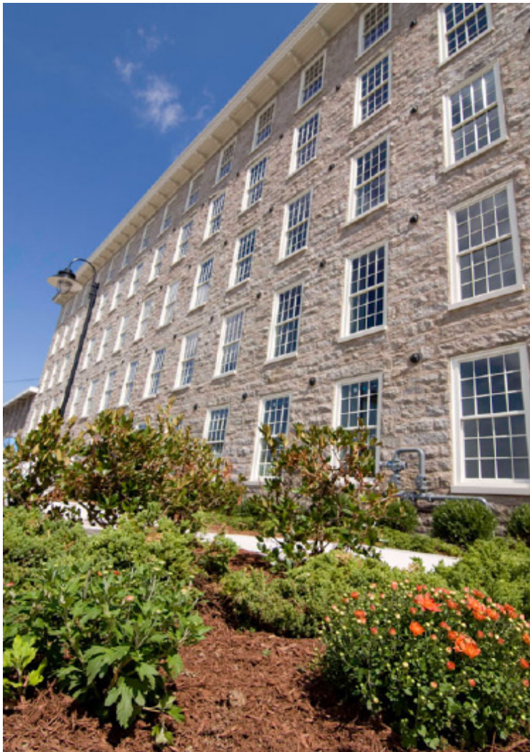
Exterior of the Curtain Lofts in Fall River, Mass., an affordable active-adults housing community for residents

For The Architectural Team Inc. of Chelsea, Mass., historic restoration and adaptive reuse aren't concepts that get trotted out occasionally as a portfolio novelty.