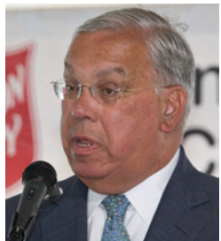
- Mayor Thomas Menino

“I think it’s so important that we have this here. The Kroc Center, The Salvation Army, the City of Boston all working together to make life a little better for the people in our city.”